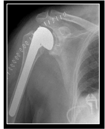
Total Shoulder Replacement

The type of shoulder replacement your surgeon performs depends upon the extent of the abnormality affecting the shoulder. Conventional total shoulder replacement is generally performed when cartilage is totally worn away, yet the rotator cuff tendons are in good condition. This type of shoulder replacement also relies on the rotator cuff muscles to move the arm. The system is modular, which allows the best fit possible. The arthritic head of the arm bone is replaced using a metal stem and highly polished metal ball. The socket is replaced with a plastic durable material.